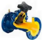
Static balancing valves